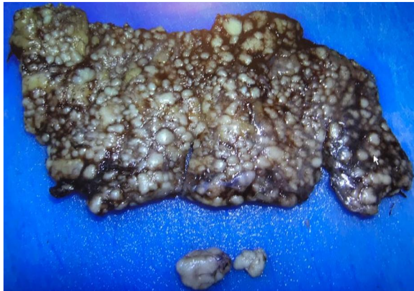
Figure (2): Large polypoid partially solid mass and multiple firm gray, white small nodules of variable size